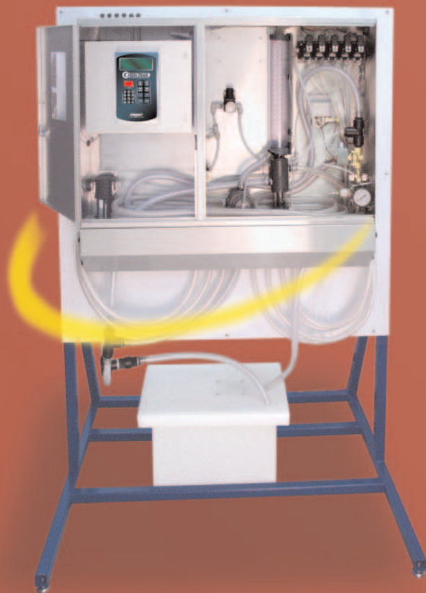
Stand-Mount Chem-Trak: Front and Back Views

Chem-Trak is the most efficient multi-washer chemical allocation system in today's market. Unlike other multi-washer systems, Chem-Trak is the only one that can deliver multiple chemical products, all at one time, to the washer. And because Chem-Trak only calibrates at programmed intervals, it dramatically reduces washer hold time! This is fantastic news for chemical suppliers and laundry facilities that need to get cleaner, more cost effective wash loads.