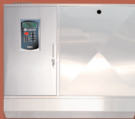
Wall-Mount Chem-Trak Control Center

Stand-Mount Dimensions: Stand-Mount Total Width: Wall-Mount Dimensions: Wall-Mount Total Width: